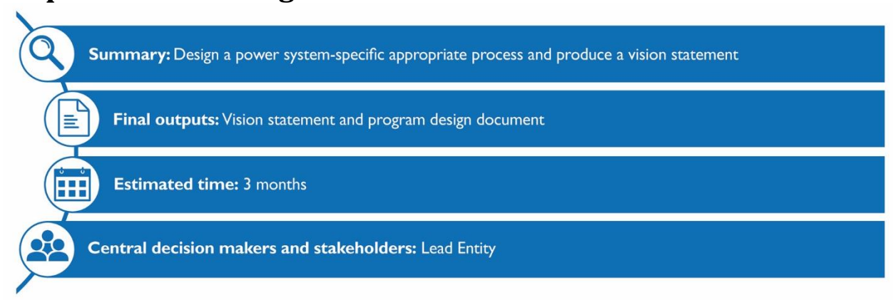
Exercise 1: Organizational Structure